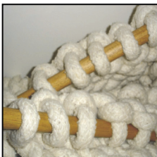
Detail of knitted piece by Pate Conaway

Beginning and Intermediate level class for all ages. Beginning knitters will learn to